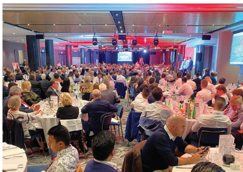
100 Years of First Grade Dinner