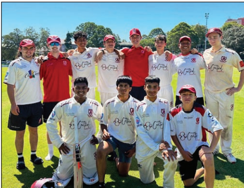
Metro team that played in the Semi-Final

W Taylor 4-20 (12) Vs Norwest Rd 12 I Ahmad 5-13 (8) Vs Norwest Rd 12 I Ahmad 4-30 (9) Vs Vs Norwest Maroon Rd 13 S Pawar 4-11 (7) Vs Norwest Maroon Rd 13