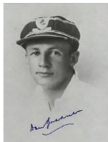
Don Bradman 1928-32