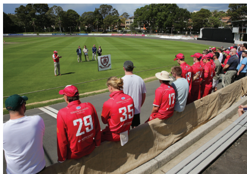
Ceremony and unveiling of the First Grade Plaques on the boundary pickets at Hurstville Oval