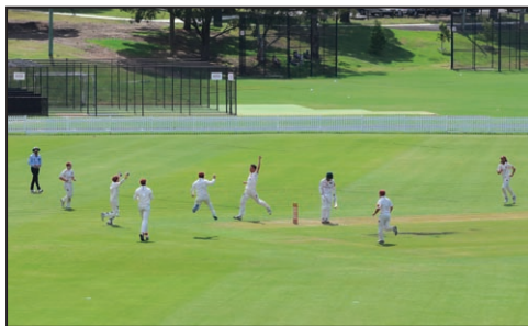
Beautiful Olds Park hosting another 5th Grade triumph