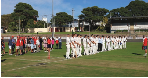
Sydney District Cricket stopped to pay tribute to one of its greats