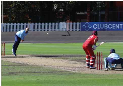
Nathan Lyon bowls to Moises Henriques