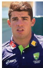
Moises Henriques 2008