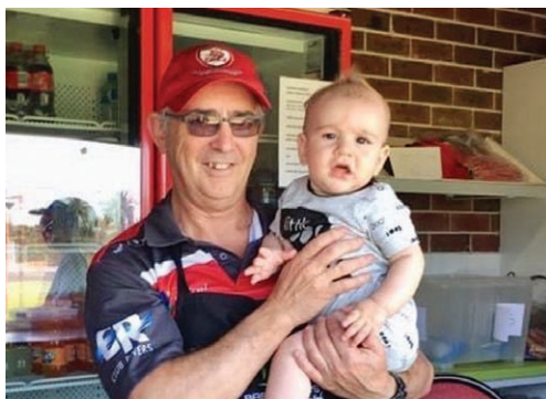
Stuart Maurice FM Cush OBE Memorial Award for Clubperson Of The Year