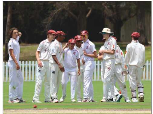
Metro team enjoying another wicket