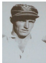
Ray Lindwall 1946-52